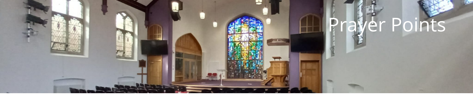
The LORD make his face to shine upon you (Numbers 6:25)